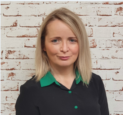
HUB MANAGER AT LUDGATE